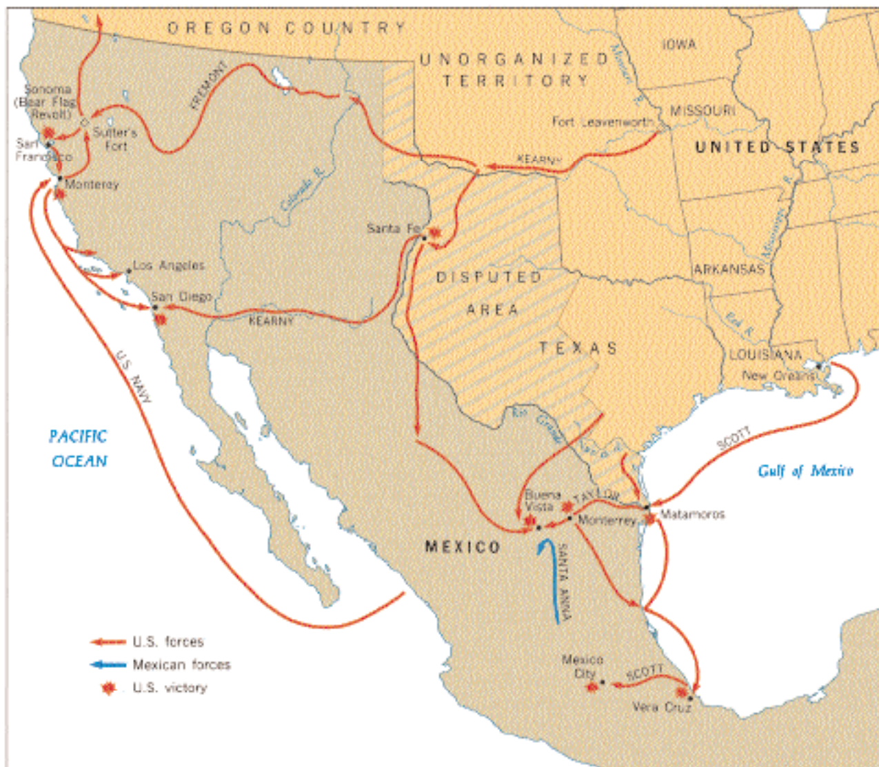
Major Campaigns of the Mexican War

upon the country by the shedding of “American blood upon the American soil.” A patriotic Congress overwhelmingly voted for war, and enthusiastic volunteers cried, “Ho for the Halls of the Montezumas!” and “Mexico or Death!” Inflamed by the war fever, even antislavery Whig bastions melted and joined with the rest of the nation, though they later condemned “Jimmy Polk’s war.” As James Russell Lowell of Massachusetts lamented,